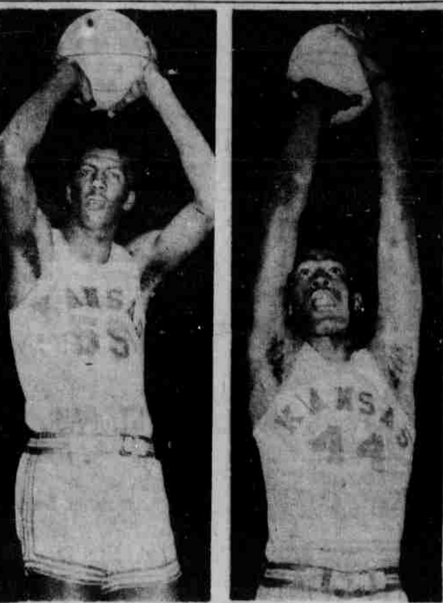
BIG MEN IN KU LINEUP

Belles at their best! COED FOL hats scop? Register now. No regis-tion fee. Employer's Personnel acement Service. 1307 L St.