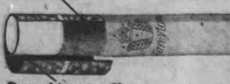
Pure white outer filter