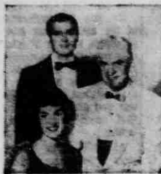
FRED WARING And His Pennsylvanians Stereo Festival.

Student Memberships $4.00 From Student Salesmen Or At Nebraska Union Booth. Now Thru Oct. 7.