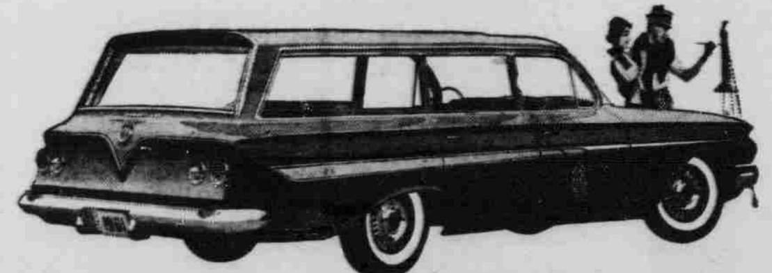
NOMAD 9-PASSENGER STATION WAGON. You have a choice of six Chevrolet wagons, each with a cave-sized cargo opening nearly 5 feet across.