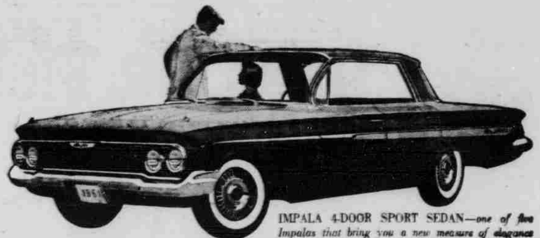
IMPALA 4-DOOR SPORT SEDAN—one of five Impalas that bring you a new measure of elegance from the most elegant Chevs of all.

Chevy's new '61 Biscaynes—6 or V8—give you a full measure of Chevrolet quality, roominess and proved performance—yet they're priced down with many cars that give you a lot less! Now you can have economy and comfort, too!