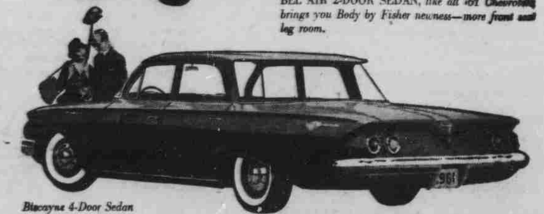
Biscayne 4-Door Sedan

the newest look is YALE 1901 from Quentin's