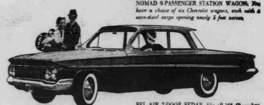
BEL AIR 2-DOOR SEDAN, like all '61 Chevrolets brings you Body by Fisher newness—more front and leg room.