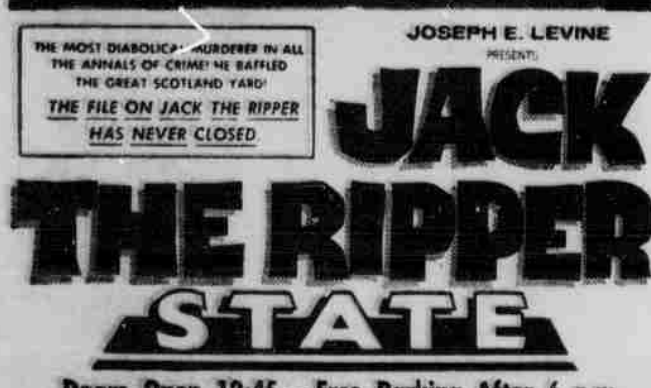
Doors Open 12:45 - Free Parking After 6 p.m.