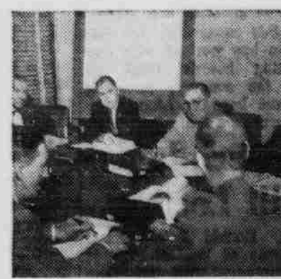
"11:00 c.m. At an interdepartmental conference I help plan procedures for another job that I've been assigned. Working closely with other departments of the company broadens your experience and know-how tremendously."