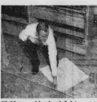
"2:00 p.m. After lunch I drive out to the Gleaview office. Here, in the frame room, I'm checking floor space required by the proposed equipment. Believe me, the way our business is growing, every square foot counts."