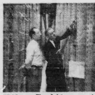
"3:10 p.m. Then I drive over to the office at nearby Skokie where a recent engineering assignment of mine is in its final stages. Here I'm suggesting a modification to the Western Electric installation foreman on the job."