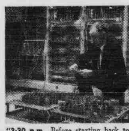
"3:30 p.m. Before starting back to Chicago, I examine a piece of Out Sender equipment being removed from the Skokie central office. This unit might fit in just fine at one of our other offices. I'll look into it tomorrow."

"Well, that was today. Tomorrow will be different. As you can see, I take a job from the beginning and follow it through. Often I have a lot of jobs in various stages at the same time. I think most engineers would agree, that keeps work interesting."