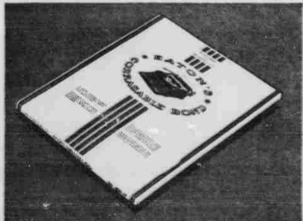
Erasable Corrasable is available in all the weights you might require—light, medium and heavy weights. In convenient 100-sheet packets and 500-sheet ream boxes. A Berkshire Typewriter Paper, backed by the famous Eaton name.

Try it! Just the flick of a pencil-eraser and your typing errors are gone! It's like magic! The special surface of Corrasable Bond erases without a trace. Your first typing effort is the finished copy when Corrasable puts things right. This fine quality bond gives a handsome appearance to all your work. Saves time and money, too!