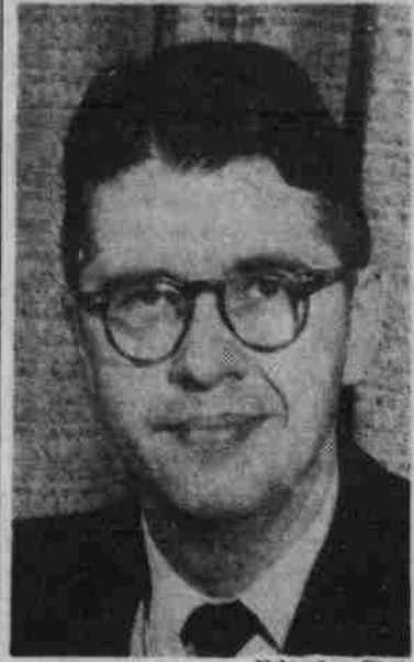
Nebraska Photo DONALDSON

positive reply will be sent contracts next fall.