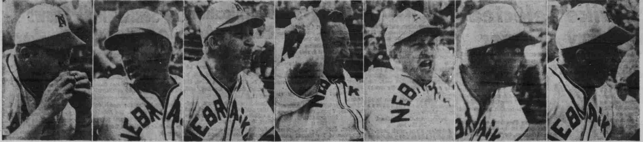
(Nebraska Photo.) Eagle Eye (Nebraska Photo.) If he gets on, bunt (Nebraska Photo.) Slide, Willie, Slide (Nebraska Photo.) Should he hit away (Nebraska Photo.) It looked good from here, ump. (Nebraska Photo.) Everythings under control. (Nebraska Photo.) Nice Pitch, Roger