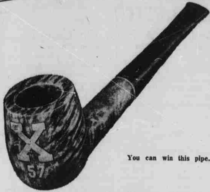
You can win this pipe.