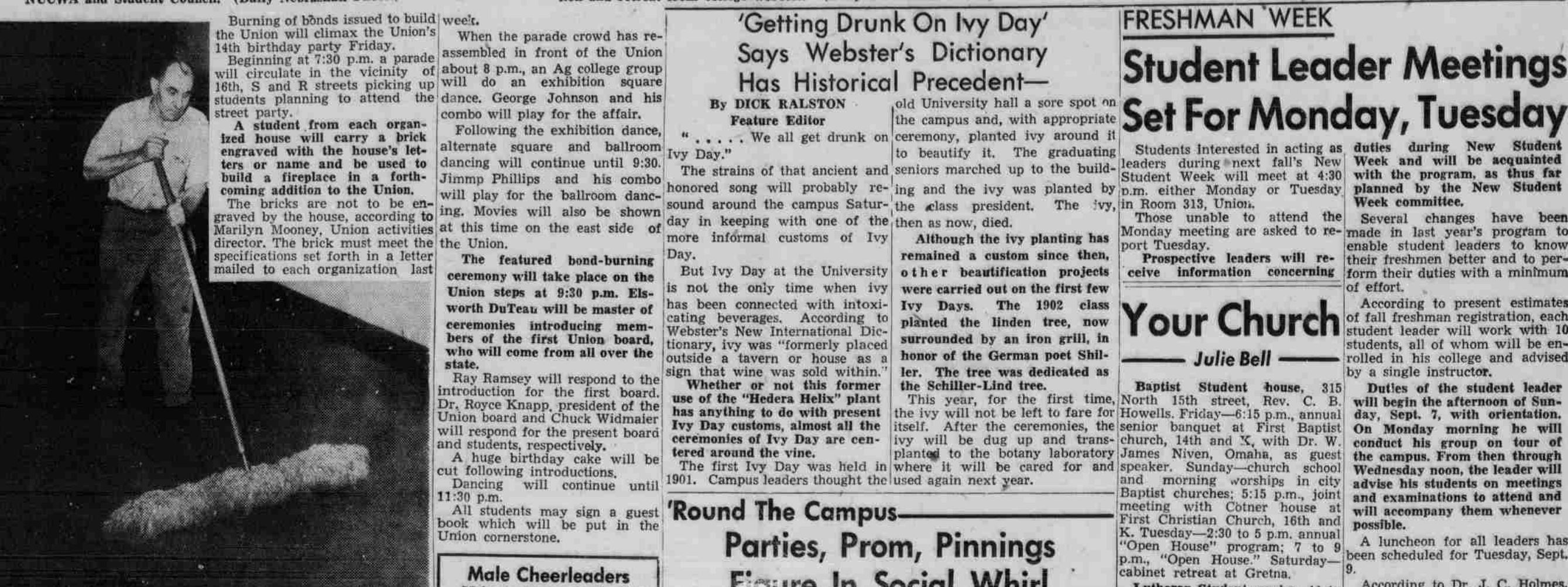
THERE'S WORK TO IT . . . All is not fun and entertainment for the full time staff of Union employes needed to keep this Campus clean and operating. Dietians, janitors, waiters, bookkeepers and dozens of other full time workers are employed by the Union. (Daily Nebraskan Photo.)

NUCWA and Student Council, (Daily Nebraskan Photo.)