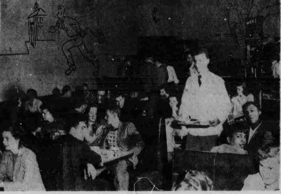
STUDENTS RELAX . . . The most frequented spot on the University campus is the Corn Crib where the Union performs one of its most valuable functions, that of providing a means of relaxa-

tion and retreat from college worries. 'Getting Drunk On Ivy Day' Says Webster's Dictionary