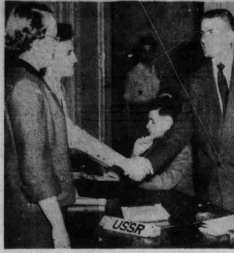
ROOM FOR EDUCATION . . . Union parlors serve as convention halls for dozens of pseudo-educational organizations such as

NUCWA and Student Council, (Daily Nebraskan Photo.)