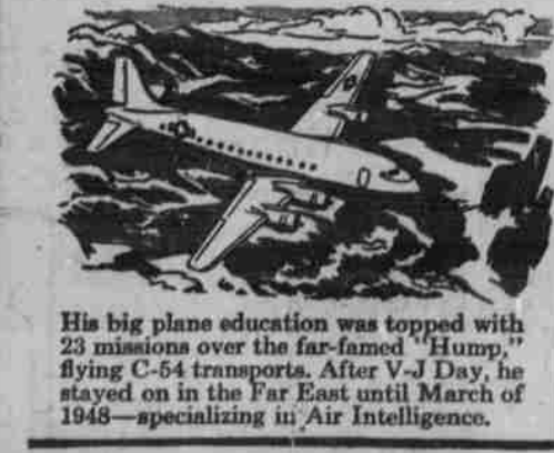
His big plane education was topped with 23 missions over the far-famed "Hump," flying C-54 transports. After V-J Day, he stayed on in the Far East until March of 1948—specializing in Air Intelligence.