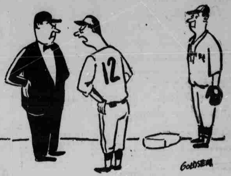
"Whom are you calling out?"

Cerv, who has hit safely in 10 straight games, tops the Nebraska hitters with a healthy .489. He also leads in doubles with four, triples with two, home runs with four, stolen bases with six and total bases with 43.