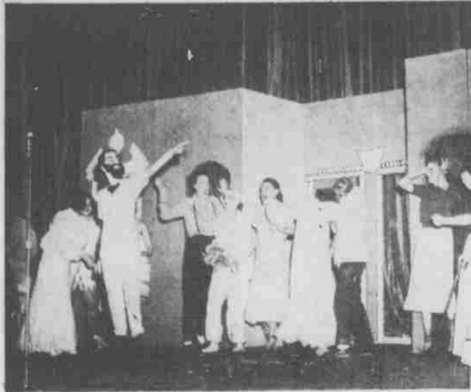
1949 WINNER—"The Dread Alarm—Oh! Awful Fate," a take-off on grand opera, won top honors for Alpha Phi in the skit competition at last year's Coed Follies. The story of an apartment house fire was told in the lyrics. Music was taken from such operas as "Carmen" and "Martha."