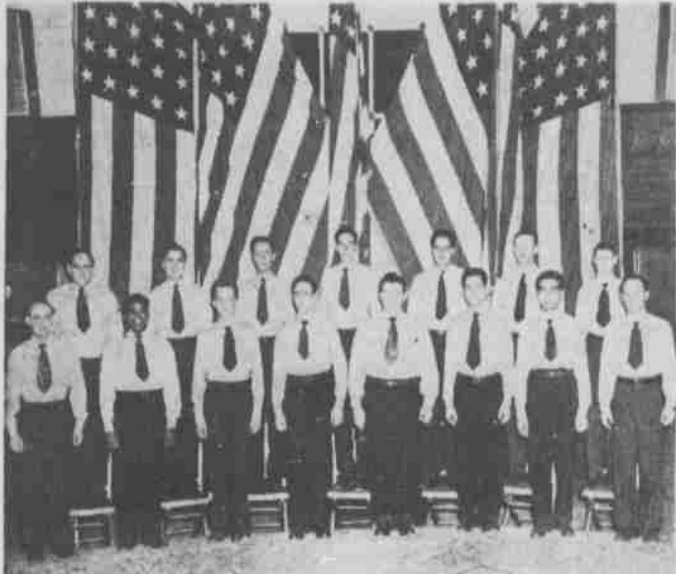
AMERICAN MALE CHORUS—The twenty voice chorus will present a concert at Irving Junior High School Friday, Feb. 17 at 8:30 p. m. Composed entirely of ex-servicemen, the group was originally formed as a military chorus. They toured the South Pacific during World War II and have appeared in cities throughout the nation since then. Their repertoire includes familiar folk songs and selections from light opera.