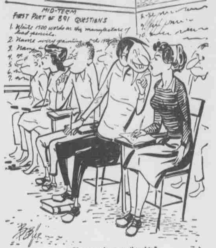
"A penny for your thoughts."

On display at the Goldenrod Stationery Store 215 North 14th St.