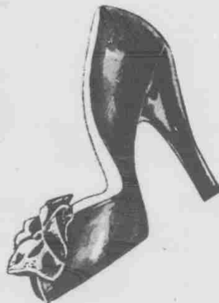
"DeLorvely" again, because you demanded it! This time cleverly endowed with flat leather bow trim. Distinctive in Navy calf.