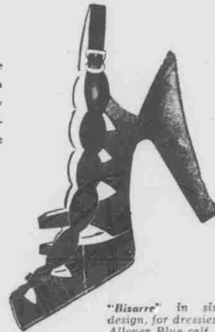
"Bizarre" in simplified design, for dressiest times. Allover Blue calf.

You'll see the famed Delman detail, the ever new Delman silhouette, the Delman delicacy of design in these dashing new DELMANETTES... at young prices! Wonderfully smart and exciting... they're styled for you!