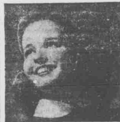
"Seventeen's for me," says campus queen