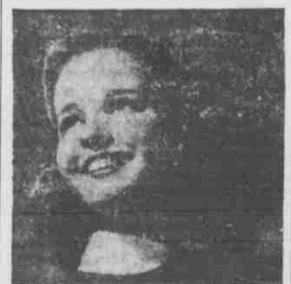
"Seventeen's for me," says campus queen