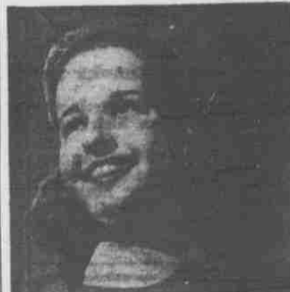
"Seventeen's for me," says campus queen

World's most wanted pen... writes dry with wet ink!