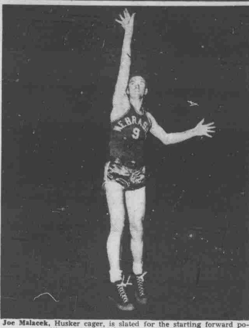
sition against Minnesota in Monday's tilt.

At exactly 7:05 or was it 7:06 -anyway sometime between 7 and 9:30-the portals were thrown open and a beautiful display of massive figures danced up and down the floor. Some of these gay fellows were decked in glowing crimson and white and others were clad in bright green and three-year regular at center; Wally white strin