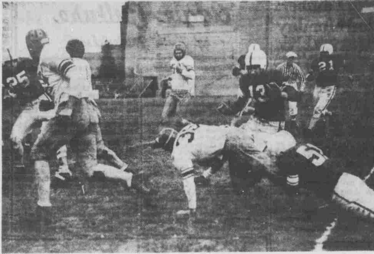
HARD-HITTING KANSAS STATE frosh downed the Husker yearlings in grim battle Thursday afternoon. Nebraska