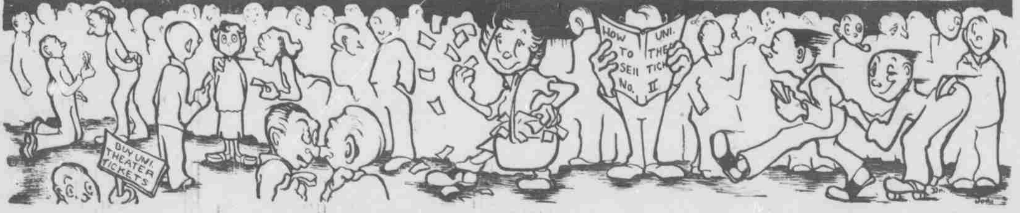
Organized houses set a fast pace to win the Honorary Producers race.