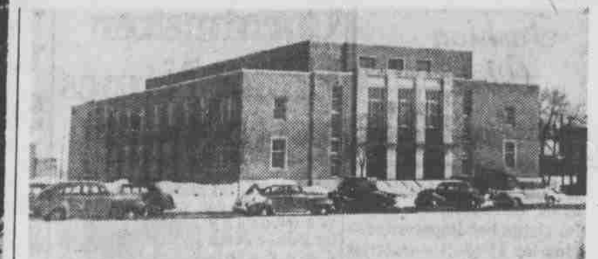
NAVAL ARMORY—One of the new university buildings to be put into use this year is the Naval Armory shown above. Located at 14th and Vine streets, this building was specially designed to har-monize with the architecture of the coliseum next to it.

The plans were made by Hare & Hare, prominent landscape artists of Kansas City, Mo., in cooperation with the university architecture department and operating superintendent's office.