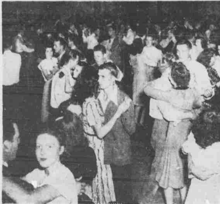
NU students dancing in the ballroom of the Student Union at the first "open house" a year ago. The 1949 open house is scheduled for this Friday evening, 8:30 p. m.