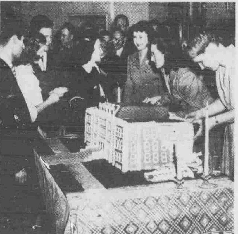
Members of the Union Board, cutting the 10th birthday cake for the Student Union. The cake was a frosted replica of the building.