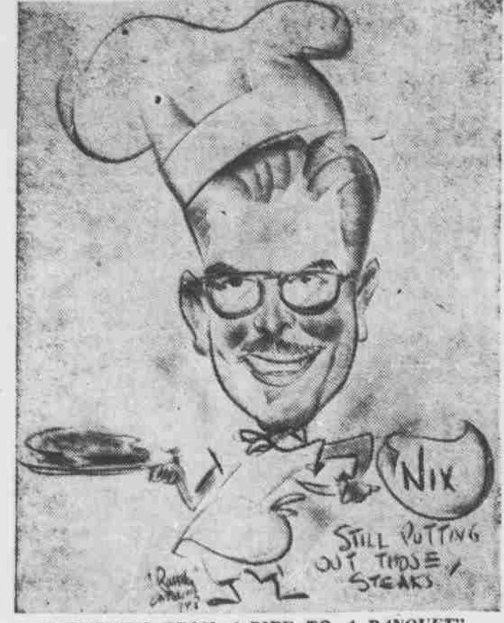
"ANYTHING FROM A BITE TO A BANQUET" NEWLY DECORATED