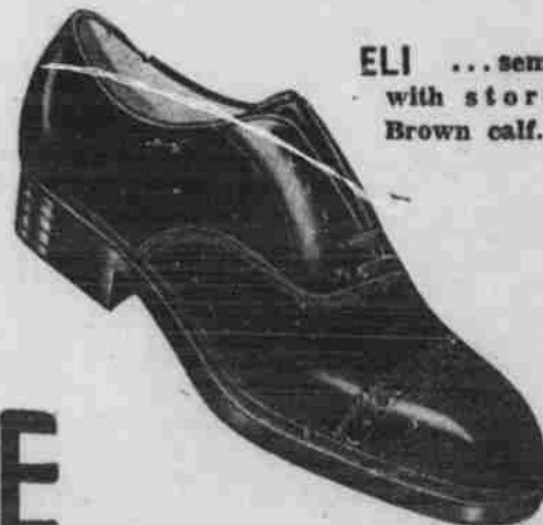
ELI . . . semi-brogue with storm weld. Brown calf.