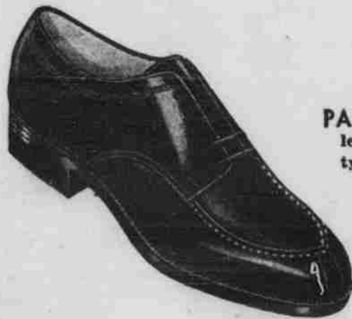
PAUL . . . smooth leather moccasin-type. Brown calf.