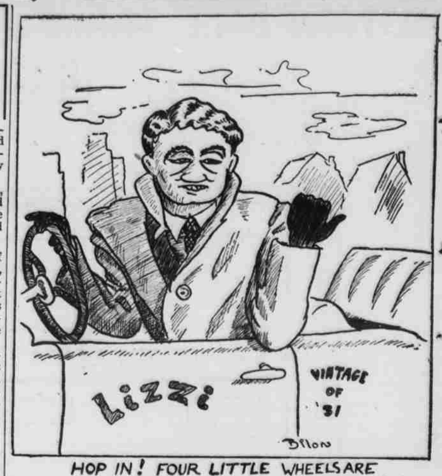
BETTER THAN ONE BIG ONE ...!

Navy Reserves interested in returning to active duty should contact the Navy Recruiting station at once in the Lincoln Post Office building.