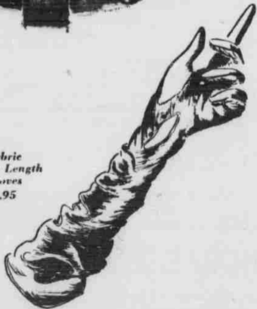
Fabric Elbow Length Gloves 2.95

Like fireworks by night, our sparkling collection of formal accessories that work heavenly magic on your costume, make you twinkle from head to foot like Christmas angels. Satins and pearls, gold and silver, glittering sequins and beads light up a glittering holiday season!