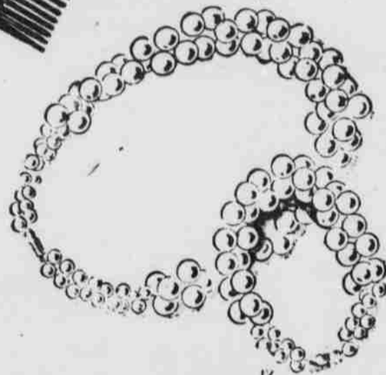
Pearl Necklaces 2.95 upward