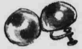
Pearl Earrings 1.95 upward

From our wonderful collections for the Ball! !