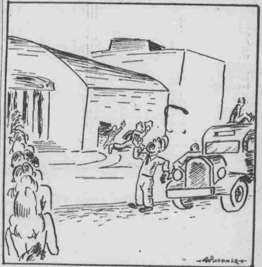
LAST BUS FOR END OF REGISTRATION LINE!