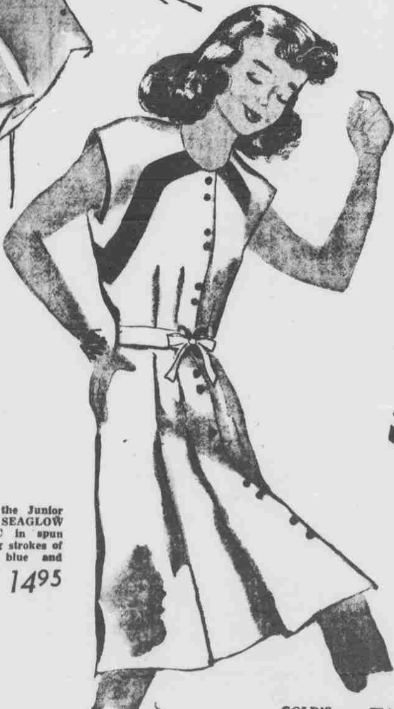
SEVENTEEN For the Junior Teens, of St. Lara a SEAGLOW SUCCESS FABRIC in spun rayon with lightning strokes of pink and white, blue and white. Sizes 7x to 13x. 14 95