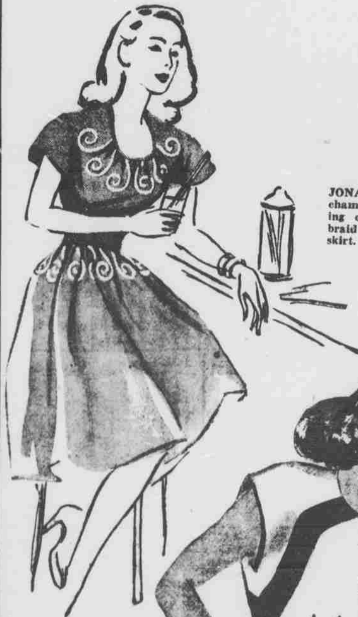
JONATHAN LOGAN'S pastel chambray set off with a whirling circle of white soutache braid at neck and skirt. Sizes 9 to 15. 12 95