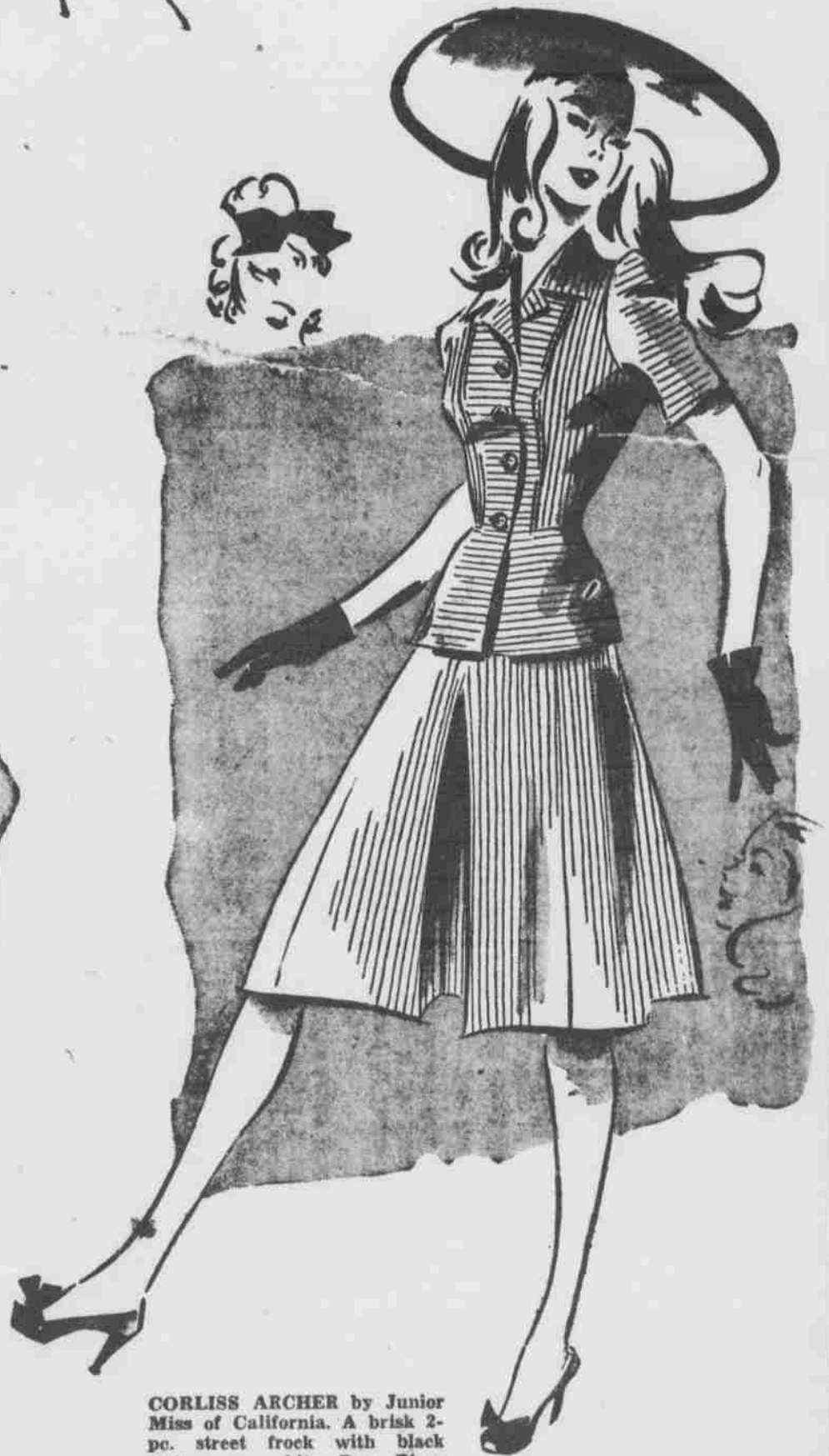
CORLISS ARCHER by Junior Miss of California. A brisk 2-pc. street frock with black stripes on white Dan River fabric. Sizes 9 to 15. 14 95