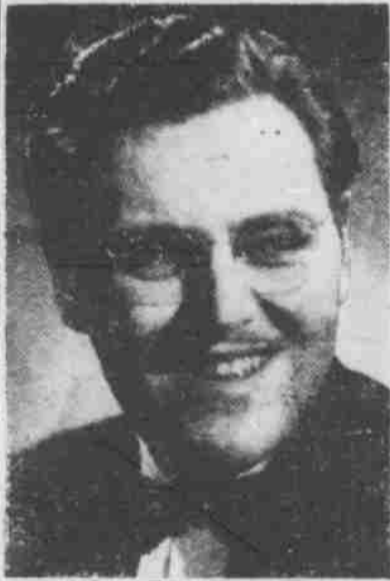
Adm. 58c Plus Tax Dancing 9 to 1