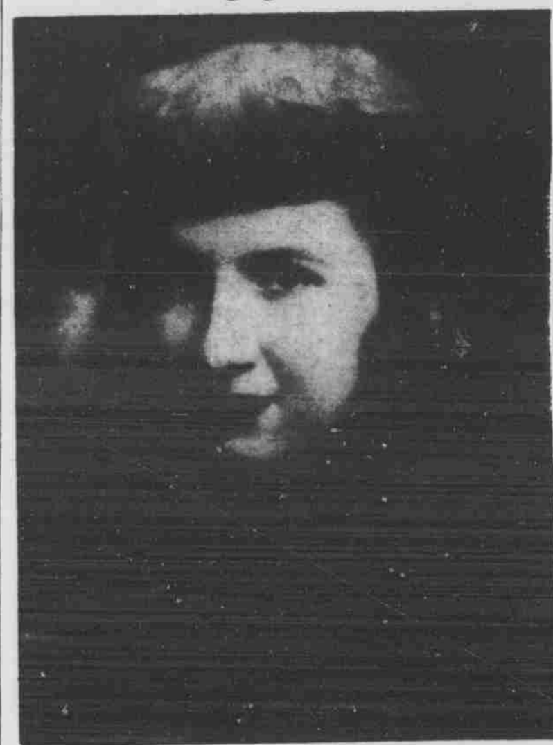
—From The Lincoln Journal.