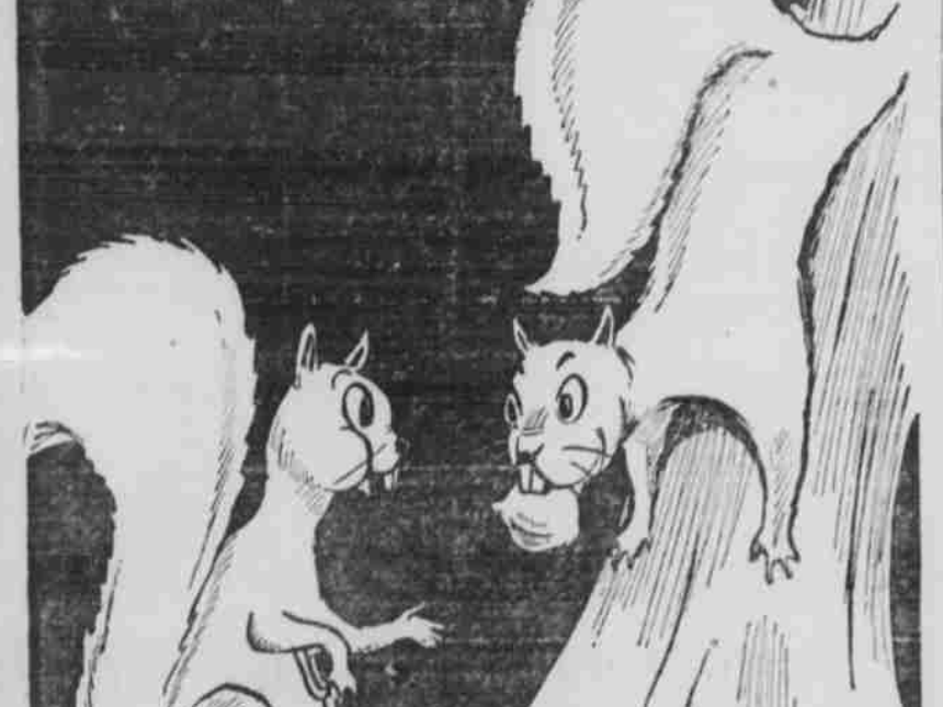
"TO HECK WITH HOARDING NUTS - I'M GOING TO HAVE A VICTORY GARDEN!"

Translation Courtesy of Modern Language Department And the Daily Interpreter.