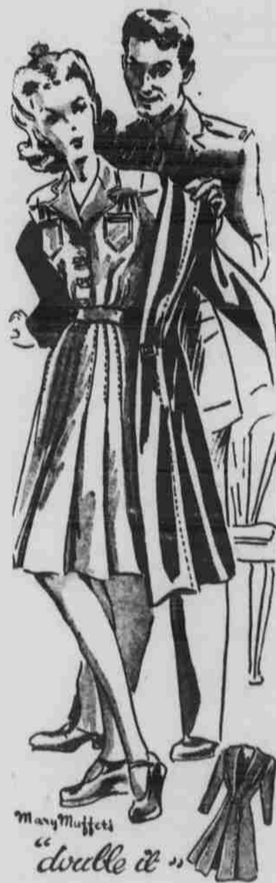
Mary Muffets "double it"

Fresh as paint . . . saucy and sweet . . . these very new MARY MUFFETS for Spring, 1943. They're the kind of dress you love for dating, for dancing and even for class! And they're happily priced for a coed's allowance.