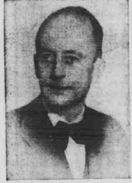
FRANZ SCHOENBERNER . . . interned and released.

Following the burning of the Reichstag, when every kind of opposition was paralyzed, Schoenberner's office was demolished.