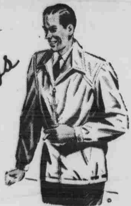
not exact illustration