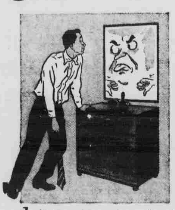
I -If your mirror makes unpleasant derisive sounds about the way your col-Iar sits on your neck . . .