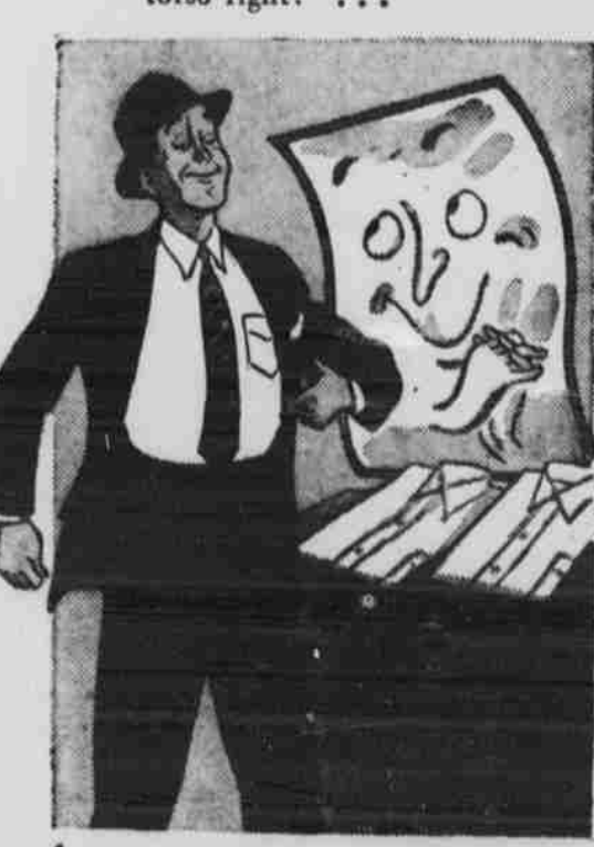
4-Then get some Arrow Shirts! They have the famed Arrow Collars . . . the exclusive bunch-eliminating "Mitoga" figure fit . . . the Sanforized label (less than 1% shrinkage) . . . Arrow's patented "anchored-on" buttons! Arrows will make you the best-dressed guy you ever saw in a mirror. $2.25 up.