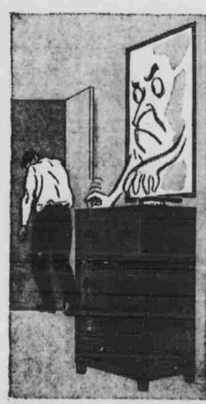
3-If it threatens you on account of loose shirt buttons that clutter your dresser . . .