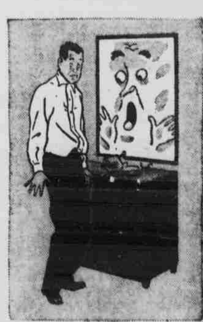
2-If it screams: "Look how messed-up your midriff is! Why can't you get shirts that fit your torso right?" . . .