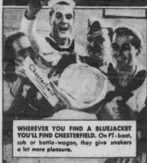
WHEREVER YOU FIND A BLUEJACKET YOU'LL FIND CHESTERFIELD. On PT-boat, sub or bottle-wagon, they give smokers a lot more pleasure.