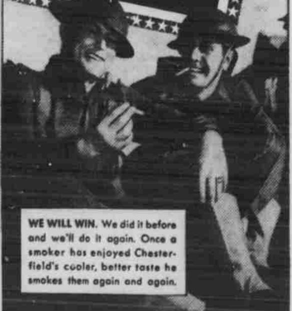
WE WILL WIN. We did it before and we'll do it again. Once a smoker has enjoyed Chesterfield's cooler, better taste he smokes them again and again.