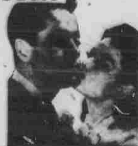
Henry FONDA • Gene TIERNEY "Rings on Her Fingers" also TED WEEMS and his ORCHESTRA

It's the funniest story since "The Lady Eve!"