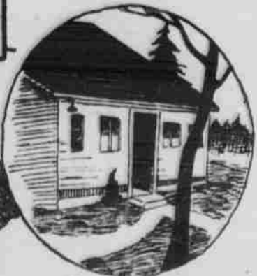
THE INFIRMARY AT REED COLLEGE, PORTLAND, ORE., IS NAMED QUIETT INFIRMARY IN MEMORY OF A STUDENT.