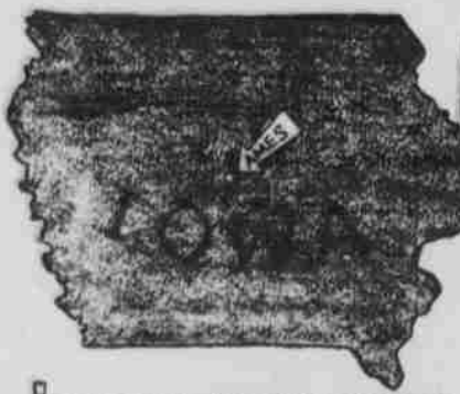
IOWA STATE COLLEGE AT AMES, IOWA, IS THE GEOGRAPHICAL . . . CENTER OF THE STATE . . .