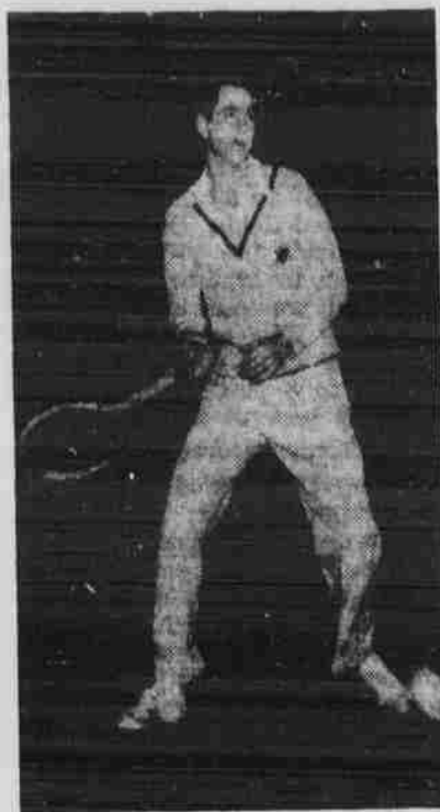
Sunday Journal and Star.

Bobby Riggs, five foot two inch tennis pro, is making things hard on the other pros in the touring tennis troupe. Bobby is in second place among the four pro stars and is always a crowd favorite. He teams with Frank Kovacs in the doubles and the duo seems to outwit Don Budge and Fred Perry.