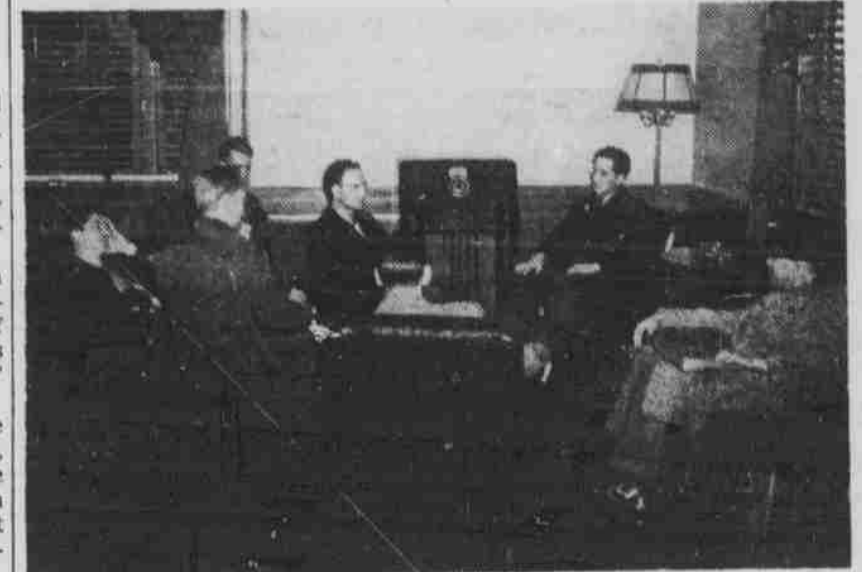
News got the nod over dance music on the Union lounge radio when war with Japan became a reality. This candid shot of a group of students listening to accounts of the Pearl Harbor bombing is typical of similar scenes around radios all over the campus.