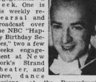
at the Pennsylvania Hotel's Cafe Rouge.

filling three different engagements a week. One is his weekly rehearsal and broadcast over the NBC "Happy Birthday Series," two a few weeks engagement at New York's Strand theater, and three, dance sessions