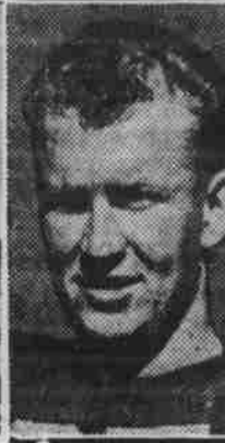
WALT LUTHER Journal and Star.