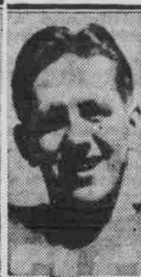
VIKE FRANCIS Journal and Star.