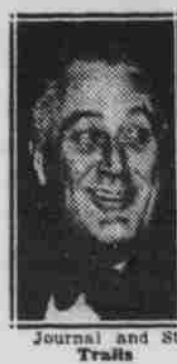
Journal and Star Traits

Featured on the pages of the Barb are pictures of interest to unaffiliated students—of activities of the weekend and intramural football.