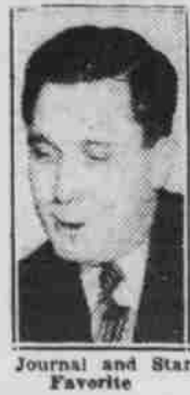
Journal and Star Favorite