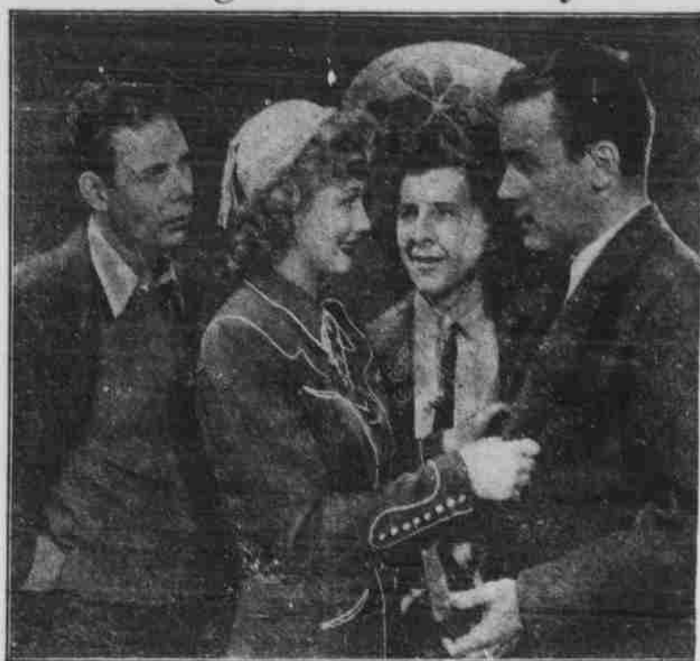
"Too Many Girls."