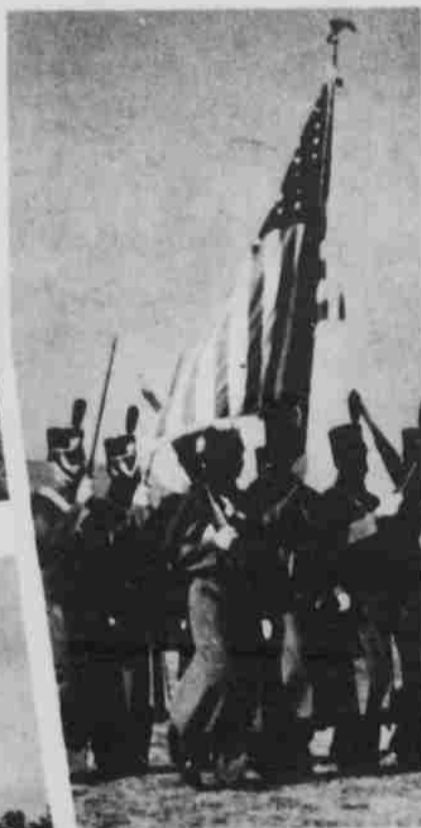
● V. M. I. is the only college in the world that wears a battle streamer on its colors. It earned this honor by going into a Civil War battle as a military unit.