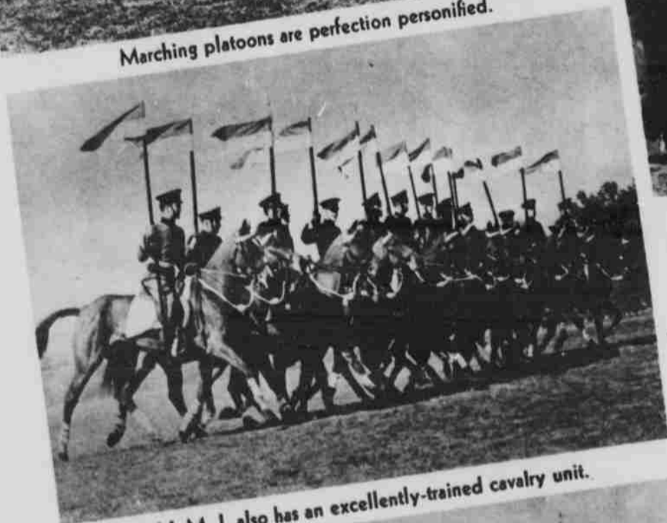
V. M. I. also has an excellently-trained cavalry unit.