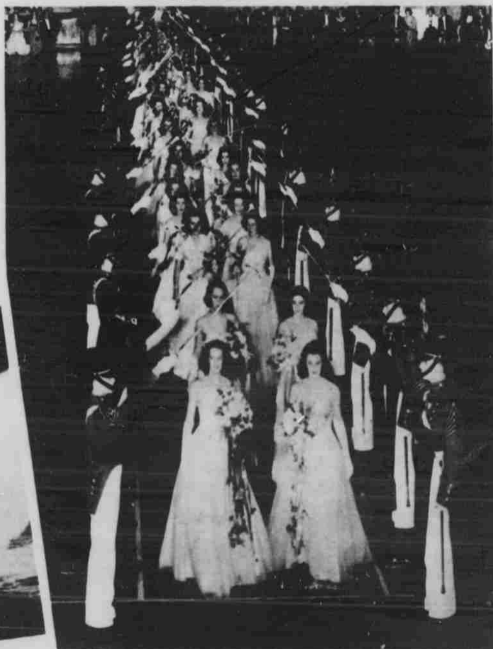
● The Institute's social functions are brilliant, with dances featuring intricate movements and colorful formations.