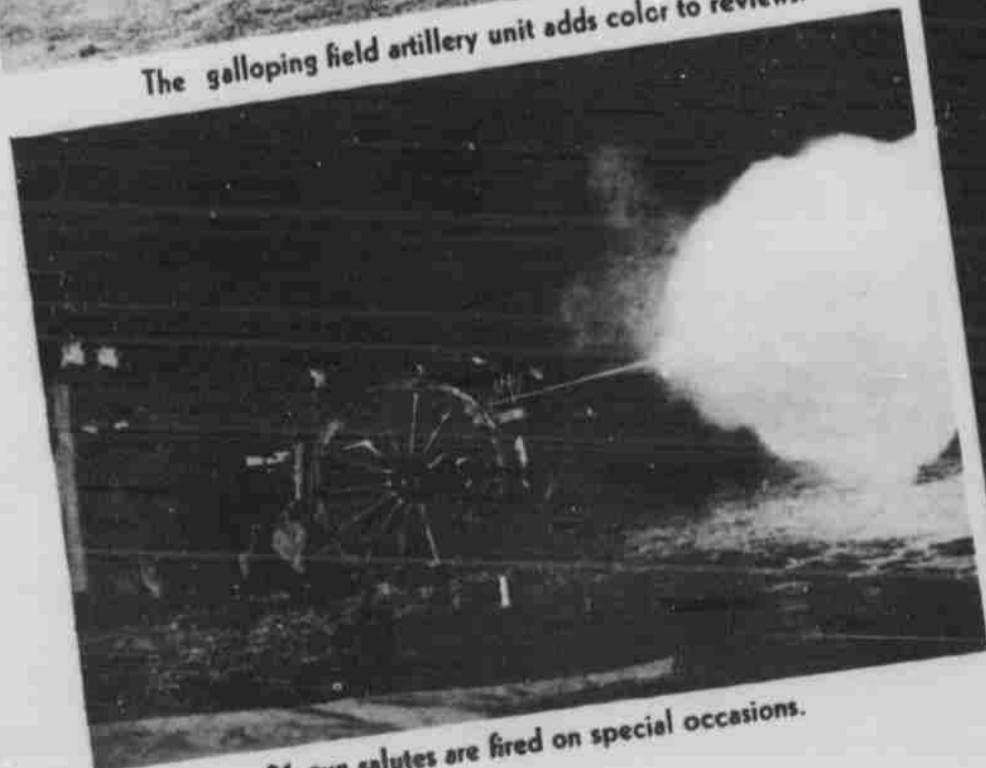
21-gun salutes are fired on special occasions.