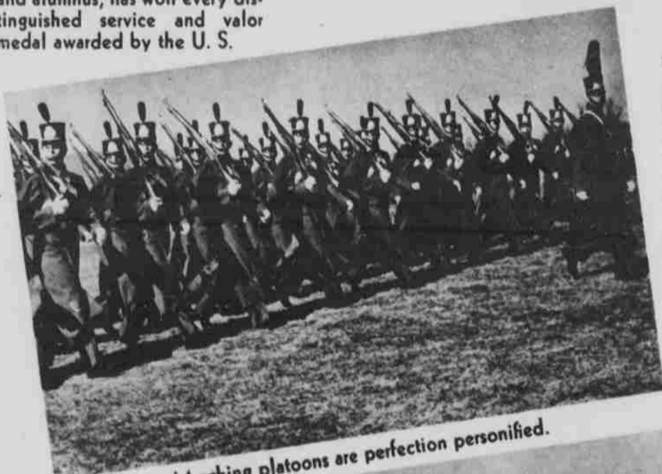
Marching platoons are perfection personified.