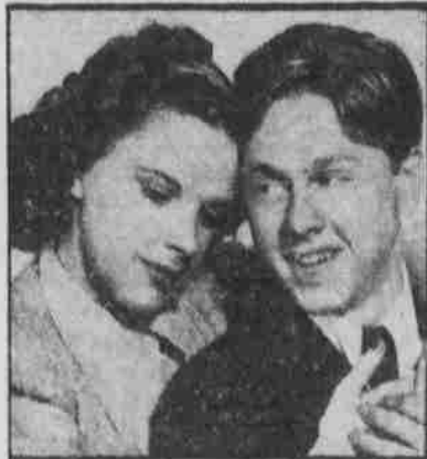
Judy Garland and Mickey Rooney star in "Babes in Arms," now showing at the Nebraska.

Rodgers and Hart wrote the musical score for the film which includes such numbers as "My