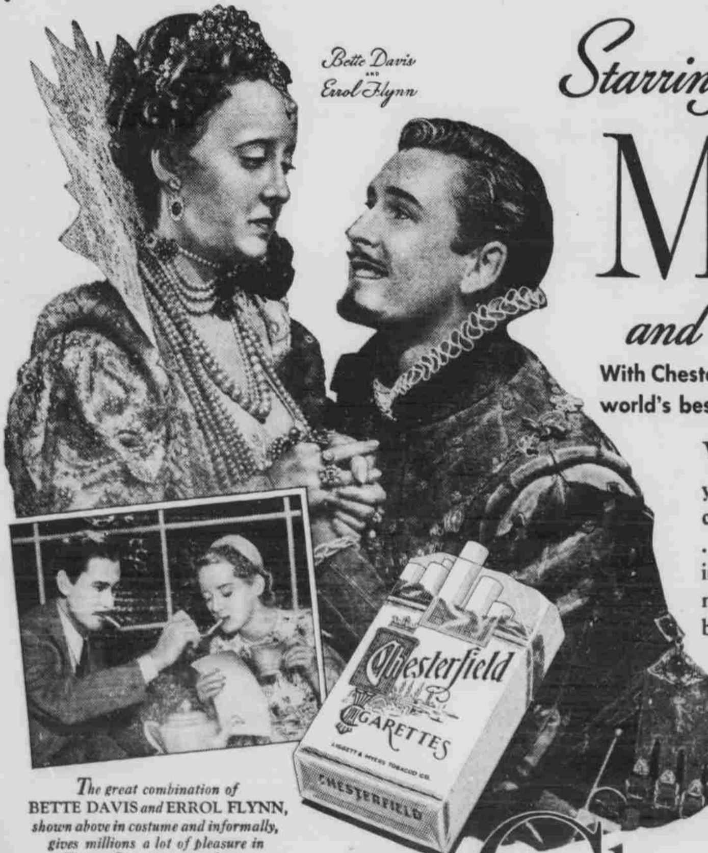
Bette Davis and Errol Flynn