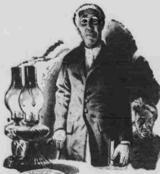
THEY COULDN'T EVEN DIE SUCCESSFULLY. Pastor Tearo held memorial services for four Tuttle lost at sea... but he talked too soon!