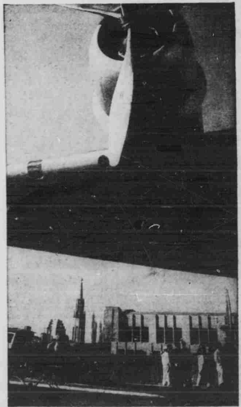
Looming overhead is part of the wing and one of the four motors of the 74-passenger Clipper Ship of Pan-American Airways in the Port of the Trade Winds at the California World's Fair. In the background is part of the Palace of Air Transportation and the 400-foot Tower of the Sun. Notice size of the huge craft compared with the crew on the landing float.