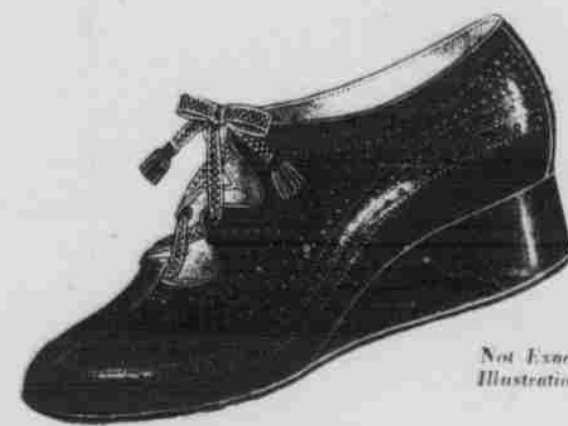
Not Exact Illustration