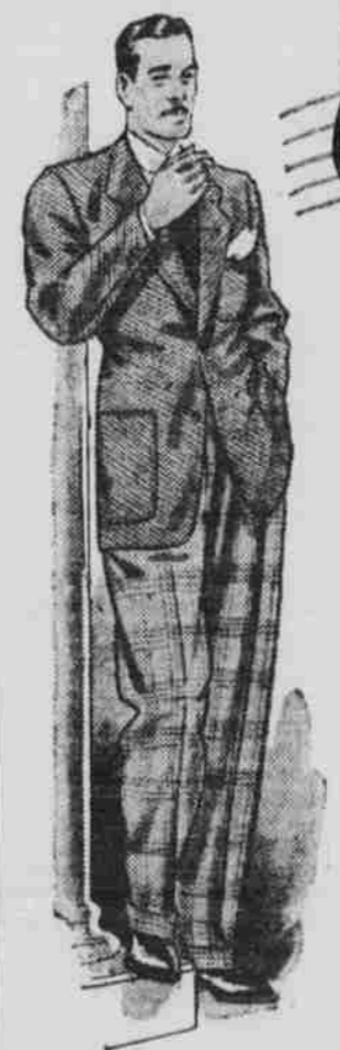
SPORT JACKETS AND SLACKS

For the NEWEST and SMARTEST in COMBINATION SPORT CLOTHES, we suggest that you see our NEW SPRING showing of SPORT JACKETS in Plaids, Checks and Plains.