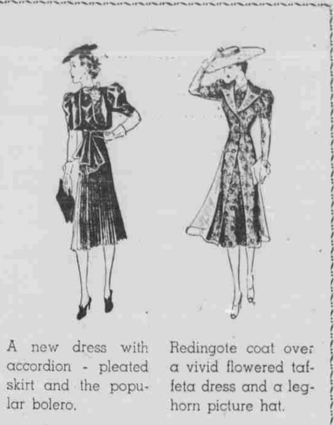
A new dress with accordion-pleated skirt and the popular bolero. Redingote coat over a vivid flowered taffeta dress and a leg-horn picture hat.