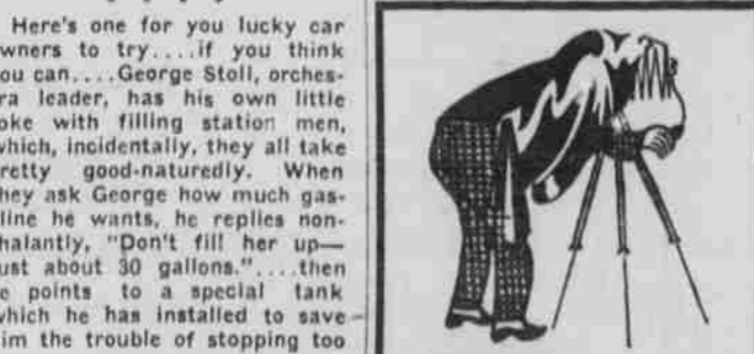
How will you look?