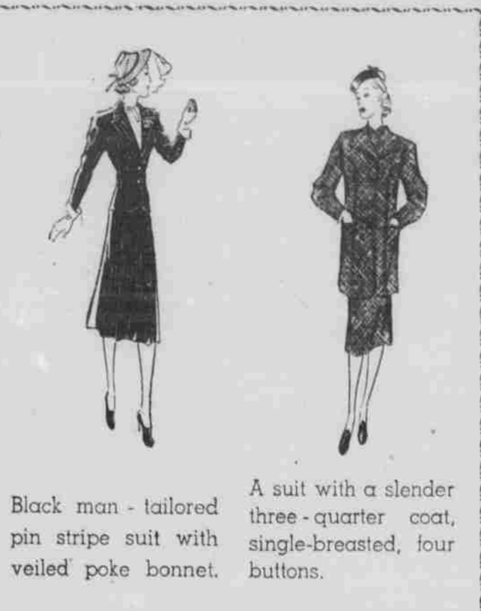
A suit with a slender three-quarter coat, single-breasted, four buttons.

With the apparent return of prosperity, people began turning to the Goodman type of music as an outlet for rising spirits. "Swing bands" have sprung up all over the country, and apparently everybody's happy.